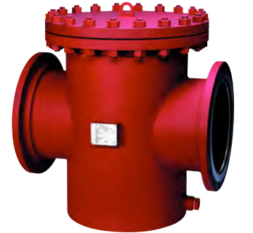
Duplex/Dual Basket Strainers