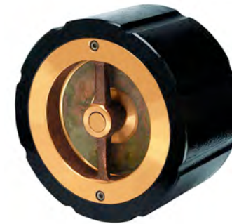
Silent Check Valves