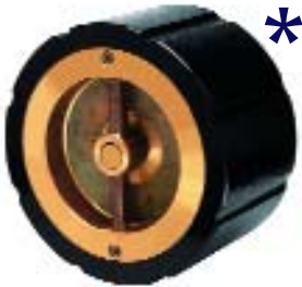
Silent Check Valves