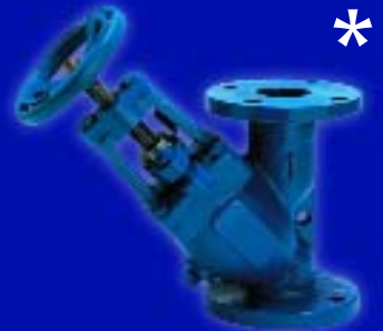
Triple Duty Valves