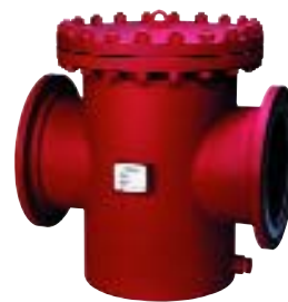
Duplex/Dual Basket Strainers