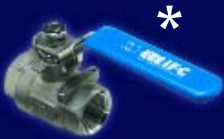
Ball Valves – One-Piece, Two-Piece & Three-Piece