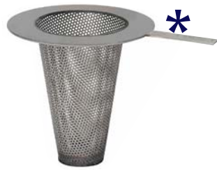
Temp. Cone, Basket & Plate Strainers