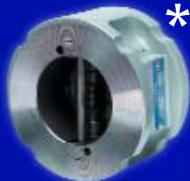
Dual Disc Check Valves