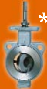
Butterfly Valves – Resilient Seated & High Performance